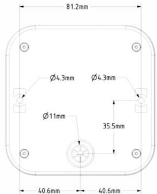
Bottom View Fixing Points and Cable Entry